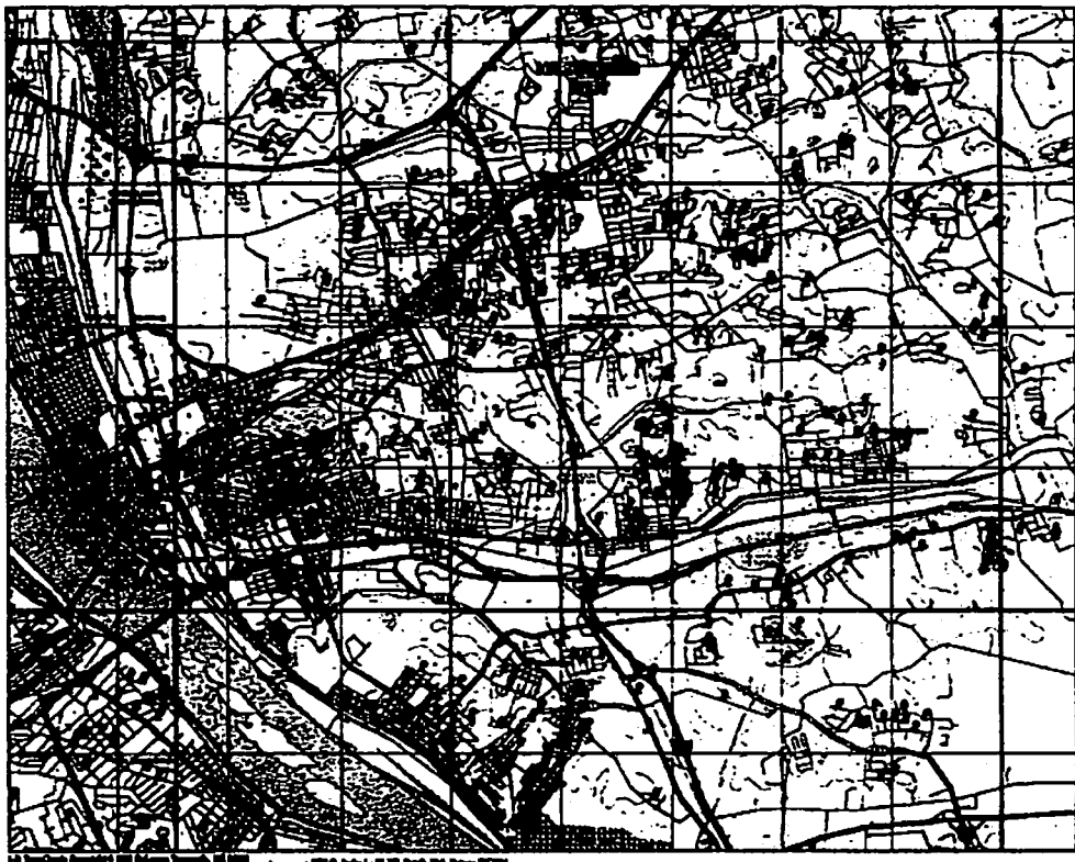
Fig. 1, Harrisburg, PA, 20 to 40 pCi/l