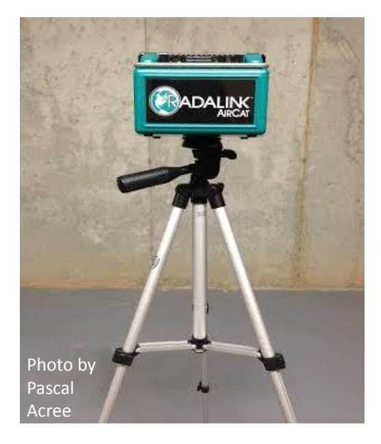
Figure (1): Experimental setup of Radalink AirCat® monitor located in basement of a three story house which had recently tested at the 4.0 pCi/l action level.

A recently calibrated, professional grade, Radalink AirCat® monitor was placed on a tripod and located in the unfinished basement of the three-story home as shown in Figure 1. This represents standard testing procedures since the lowest story of a home typically has the highest concentrations of radon.