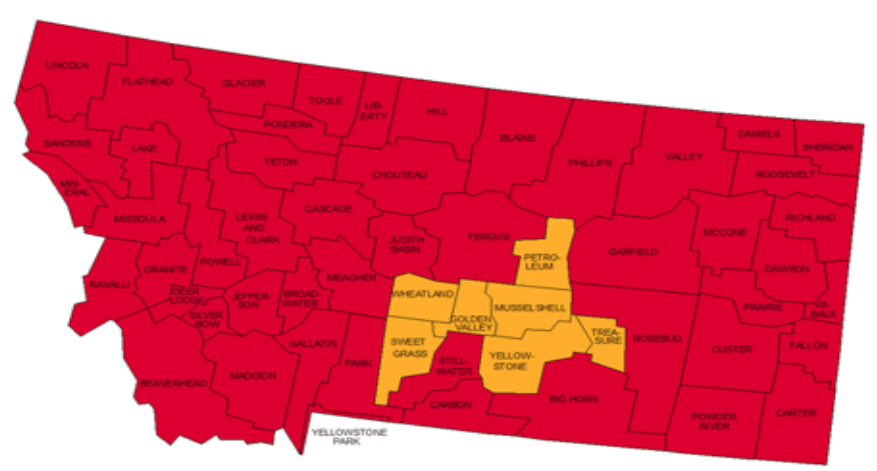
Figure (1): Montana County Radon Map.

Per a review of the literature using Lexis Nexis database, Montana does not have a federal, state, or local mandate that regulates the testing of radon in public school buildings. Assessment of the absence of a school radon policy in combination with the current radon risk environment in Montana indicates a need for protective policy.