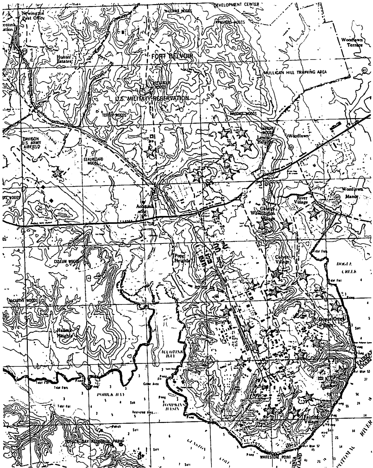
Figure 3. Fort Belvoir testing locations